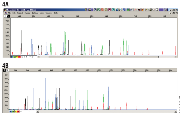
Figure 3. Analysis of DNA purified from buccal swabs without centrifugation. DNA was isolated from buccal swabs that were incubated for 120 minutes in Incubation Buffer without proteinase K. The eluted DNA (1 \mu l) was amplified with the PowerPlex® 16 System without prior quantification, and amplified fragments were analyzed with an ABI PRISM® 3100 Genetic Analyzer. Panel A. Amplification results of DNA from sample 4A. Panel B. Amplification results of DNA from sample 4B.

Both fresh buccal swabs provided full profiles with peak heights averaging 3,000RFU and excellent sister-allele balance (Figure 3). The elimination of centrifugations and DNA quantitation makes this protocol an attractive method for obtaining DNA from buccal swabs for the purpose of amplification. From an automation standpoint, this allows protocols that are entirely “walkaway”.