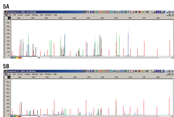
Figure 2. Analysis of DNA purified from cigarette paper without proteinase K treatment. DNA was isolated from cigarette papers that were incubated for 30 minutes in Incubation Buffer without proteinase K. The eluted DNA (1µl) was amplified with the PowerPlex 16 System without prior quantification, and the amplified fragments were analyzed with an ABI PRISM® 3100 Genetic Analyzer. Panel A. Amplification results of DNA from sample 5A. Panel B. Amplification results of DNA from sample 5B.

Incubation Buffer without proteinase K. DNA quality is highly dependent upon the quality of the original sample. Even though these samples were not stored under ideal conditions, it was surprising to obtain full profiles from samples that were incubated in Incubation Buffer without proteinase K for only 30 minutes. This illustrates the ability of the DNA IQ Lysis Buffer to extract sufficient amounts of DNA for amplification from cigarette paper.